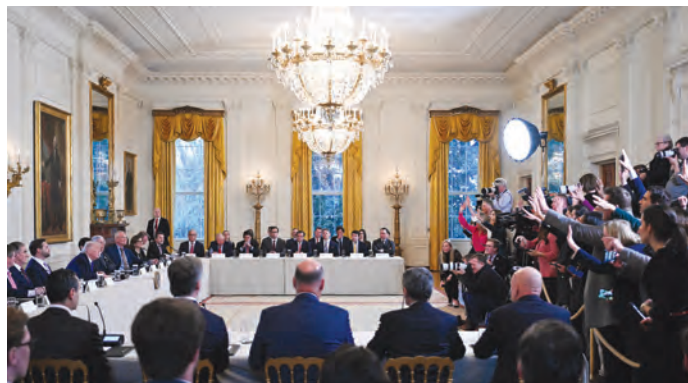
Journalists (R) ask questions as US President Donald Trump hosts a meeting with US oil company executives in the East Room of the White House in Washington, DC

"We're going to be making the decision as to which oil companies are going to go in... (we're) going to cut a deal with