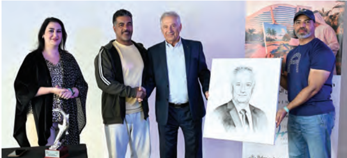
An artist shows his masterpiece

The open-air event took place at Aloha Beach, providing