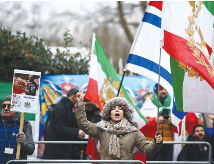
Anti-Iranian regime protesters wave the Iranian flag before the 1979 revolution with the Lion and Sun emblems and Israeli flags during a gathering outside the Iranian Embassy, central London

Ebadi warned security forces could be preparing to commit a "massacre