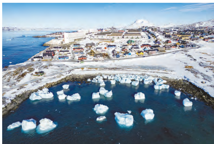
Buildings in the background off Nuuk, Greenland

*only those assessed compliant with international resource reporting standards Map data: QGreenland, US National Snow and Ice Data Center (ice extent Aug 2024) Source: Geological Survey of Denmark and Greenland, Review of Critical Raw Material Resource Potential in Greenland