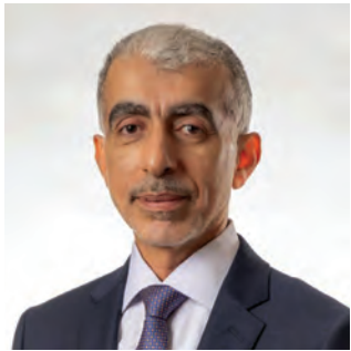
H.E. Ibrahim bin Hassan Al Hawaj

The minister explained that the project responds to urban growth and population densi-