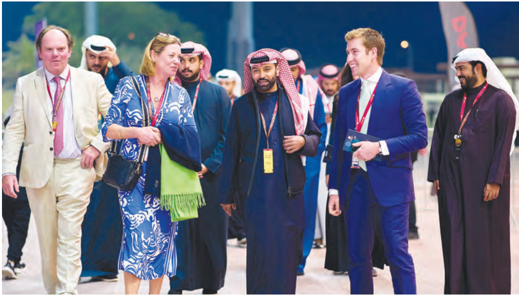
TDT | Manama