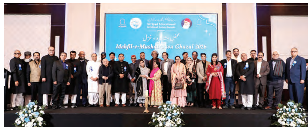
Celebrated Urdu and Hindi poets with Sir Syed Educational & Cultural Society officials and members, along with other distinguished guests

Sir Syed Educational & Cultural Society dedicates heart-touching event to Ganga Jamuni culture of India