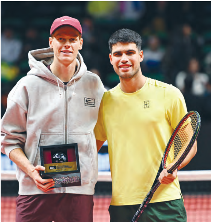
Spain's Carlos Alcaraz (R) and Italy's Jannik Sinner (L) pose with their trophies after their exhibition tennis match at Inspire Arena in Incheon

Carlos Alcaraz beat great rival Jannik Sinner in a light-hearted sell-out exhibition match in South Korea on Saturday ahead of the Australian Open. Eight days before the Melbourne Grand Slam and in their first appearances this year, the Spanish world number one won 7-5, 7-6 (8/6) in front of an enthusiastic 12,000 crowd in Incheon. Neither will play competitively until the Australian Open, where Italy's world number two Sinner is the defending two-time champion. South Korean organisers have not said how much the two players earned, but reports in Italy suggest each could pocket more than $2 million for the match that lasted one hour and 47 minutes. It was not always entirely serious, the smiling duo treating a packed house to some trick shots between their legs, draw-