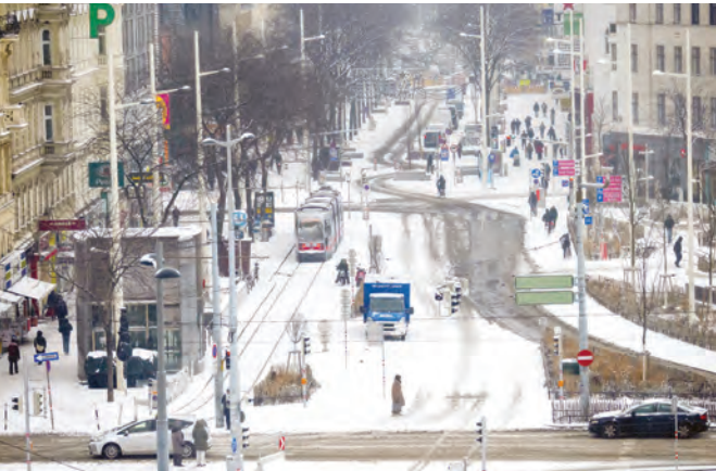
Pedestrians brave sub-zero temperatures in the snow covered Mariahilfer shopping street in Vienna, Austria AFP | London, United Kingdom

◆ US President Donald Trump on Friday again suggested the use of force to seize Greenland as he brushed aside Denmark's sovereignty over the autonomous Arctic island. "We are going to do something on Greenland, whether they like it or not," Trump said at a White House meeting with oil executives looking to benefit in Venezuela, where the United States last week overthrew the president. "I would like to make a deal, you know, the easy way. But if we don't do it the easy way, we're going to do it the hard way," Trump said when asked of Greenland. Trump says controlling the mineral-rich island is crucial for US national security given the rising military activity of Russia and China in the Arctic.