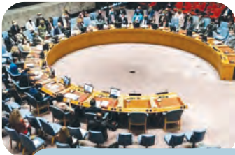
UN Security Council plans emergency meeting on Ukraine Monday

◆ The UN Security Council will meet tomorrow to discuss Ukraine, a revised scheduled showed, after Kyiv's mayor urged residents to leave the capital due to mass heating outages caused by Russian strikes. "The Russian Federation has reached an appalling new level of war crimes and crimes against humanity by its terror against civilians," Ukrainian ambassador Andriy Melnyk said in a letter to the Security Council seen by AFP on Friday. The latest strikes left half of the residential buildings in Kyiv without heating in sub-zero temperatures, Mayor Vitaliy Klitschko said. The Kremlin also confirmed firing an Oreshnik ballistic missile on Ukraine for the second time since the war began in February 2022. "The Russian Federation regime officially claims that it used an intermediate-range ballistic missile, the so-called 'Oreshnik', against the Lviv region," the ambassador's letter continued. "Such a strike represents a grave and unprecedented threat to the security of the European continent."