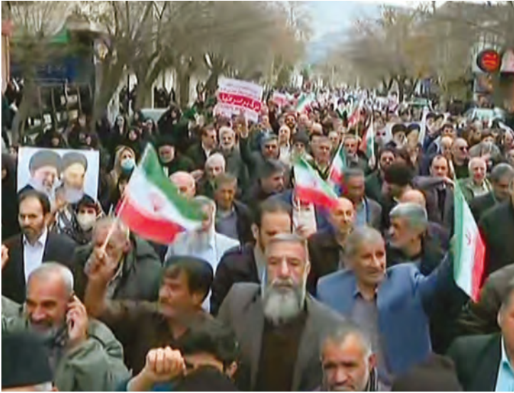
Pro-government demonstrators chanting slogans as they march along a main street in Khorramabad, western Iran

● People banged pots and chanted anti-government slogans